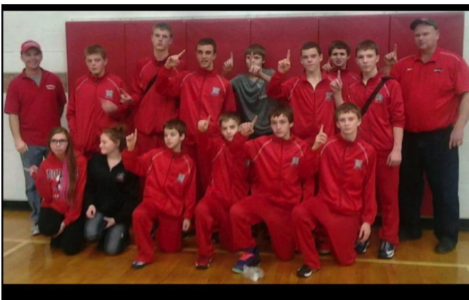
Junior High Wrestling Team - See article on Page 2.

The Northridge basketball team sits at 9-2, 5-0 in the SWBL with losses coming only to #1 state ranked Tri-Village, and a very talented Carroll team. Northridge finds itself on the verge of the D3